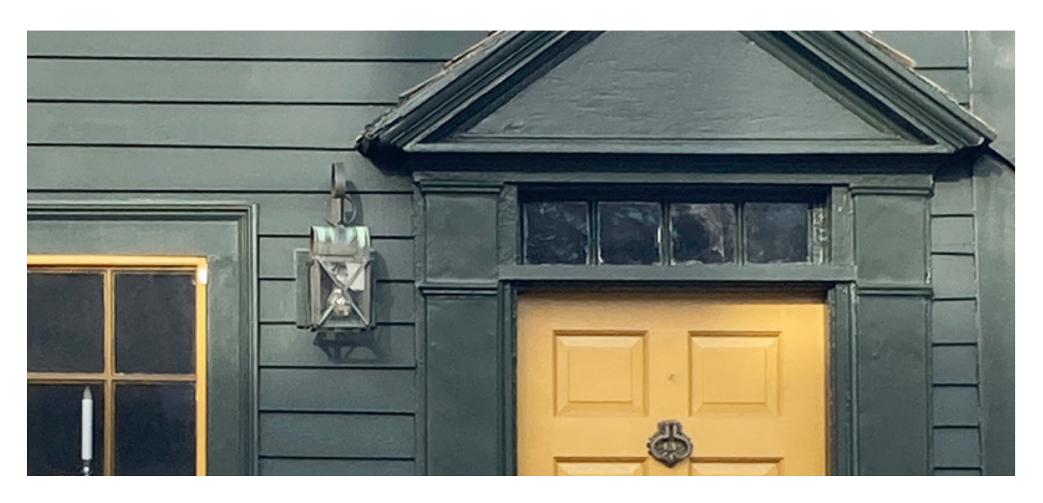
RESTAURANTS | REAL ESTATE | PLACES